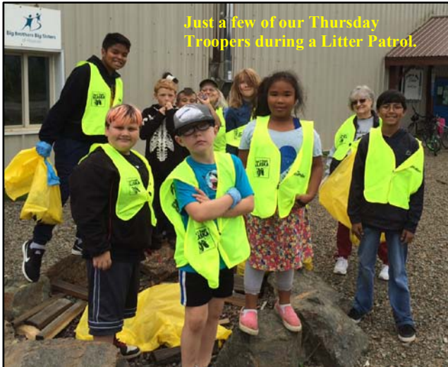
Just a few of our Thursday Troopers during a Litter Patrol.