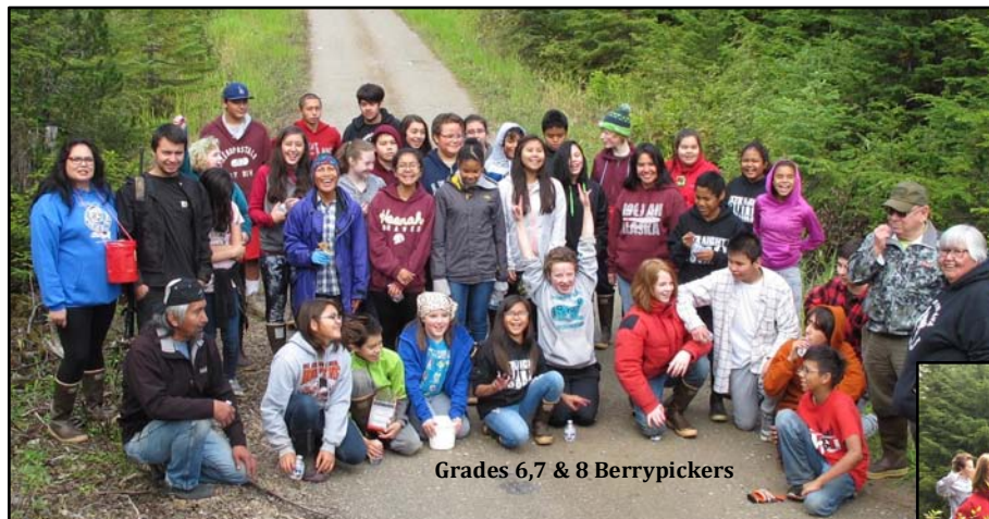
Grades 6, 7 & 8 Berrypickers

Shortly after school started in August, students in grades 6 to 12 went berrypicking. They harvested kanat’á (blueberries) & tleikatánk (huckleberries.) Drumming and singing Tlingit songs added to the fun. Some of the berries were used for math lessons afterwards, and some will be used in future art lessons.