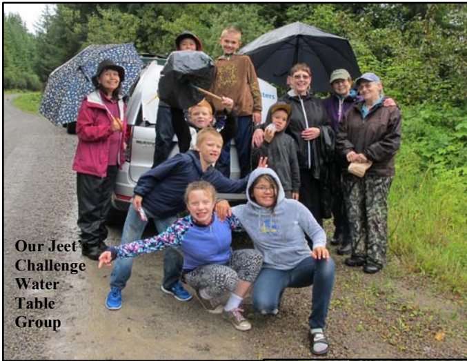
Our Jeet Challenge Water Table Group

BBBS of Hoonah had a water table for the Jeet's Challenge Race on August 26 th . A group of intrepid youth and adults under umbrellas cheered, drummed, and sang Tlingit songs to encourage the wet runners on their uphill climb.