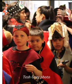
Tesh Gray photo