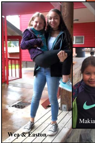
Wea & Easton