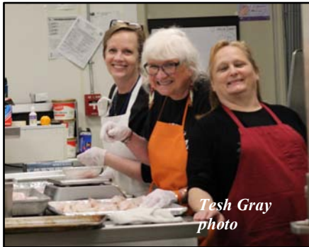
Tesh Gray photo