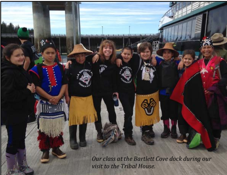
Our class at the Bartlett Cove dock during our visit to the Tribal House.

On May 12th, our class was invited by Glacier Valley Elementary, Harborview Elementary, TLE Program, TCLL Program, USDA Forest Service, the National Park Service, and HIA to go to Bartlett Cove. We got to visit the Xunaa Tribal House and learn about the screens and house posts and the stories they tell. We heard the Chookaneidí oral history and songs, and listened to the Raven's response to the Chookaneidí. Our class, along with some of the high school students, sang and danced the Glacier Bay songs for the Juneau group.