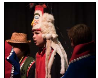
Ku.éex’